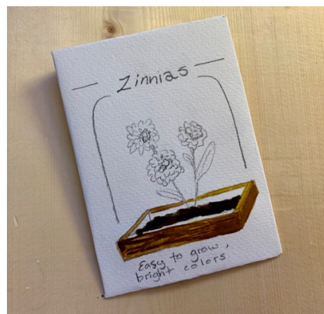
Paint a container for your plant.