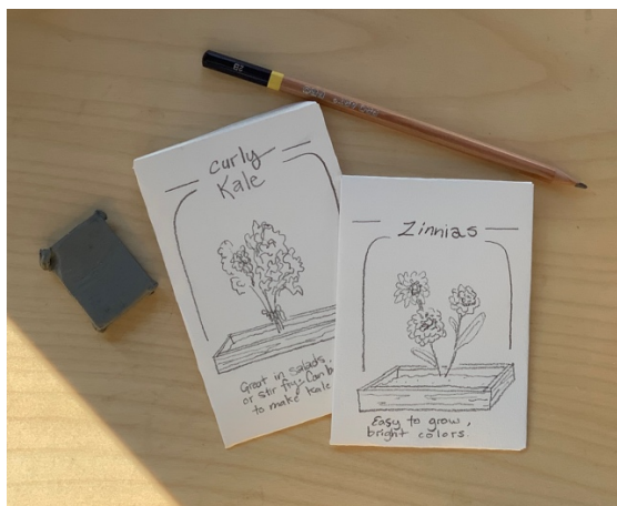
Add a description of the plant/growing info.