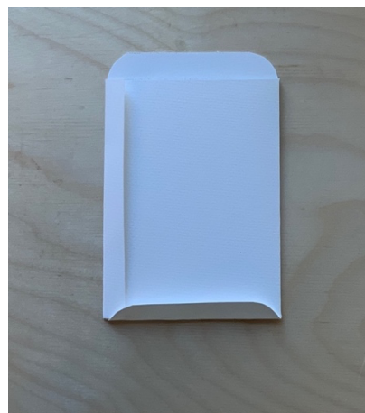
Fold over bottom flap.