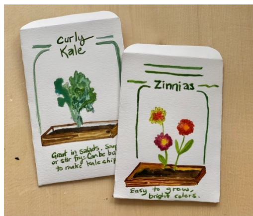
Fill packets with seeds to share or save.