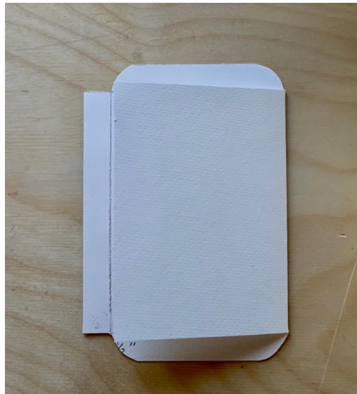
Fold over 3\frac{1}{4} " section.