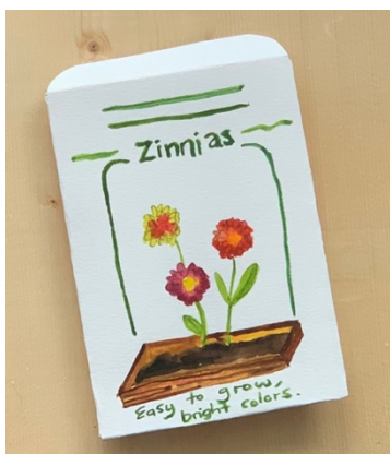
Paint the plant your seeds will become.