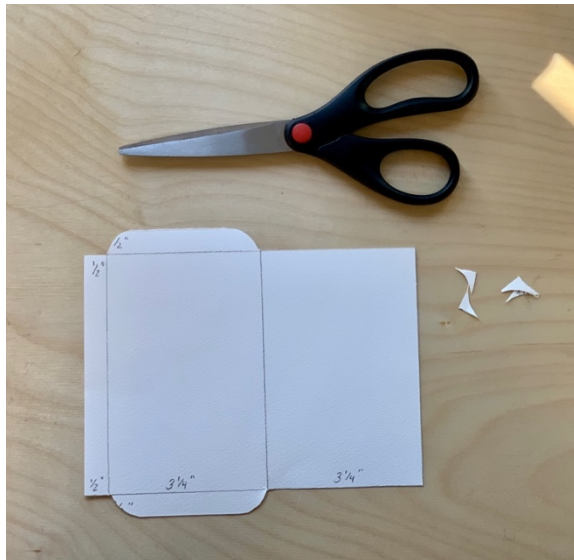
Cut rounded corners on fold over flaps.