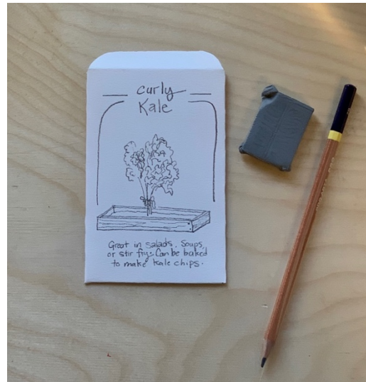
Draw a picture of the mature plant.