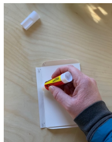
Glue side and bottom flaps.