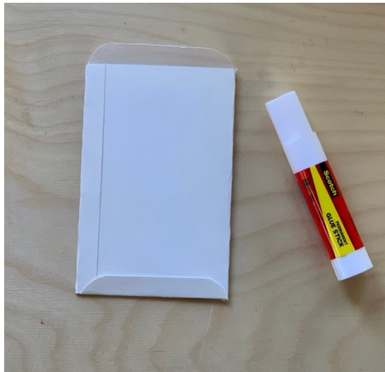
Leave top flap unglued (to add seeds).