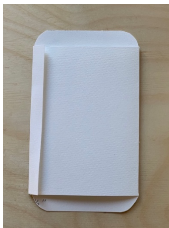
Fold over middle flap.