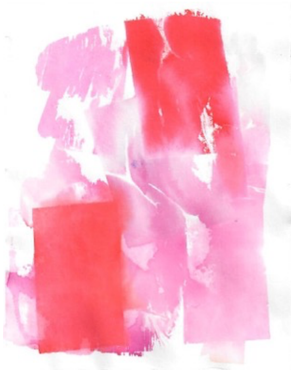
1. Create a tissue print.