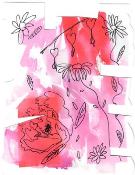
2. Cut a decorative edge to your print.