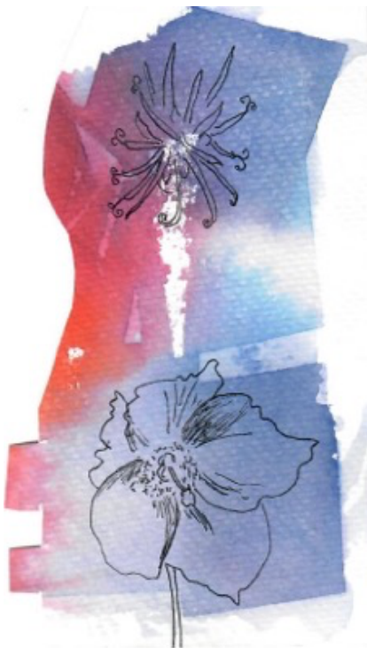
7. Explore other types of flowers.