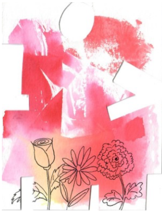
5. Repeat the steps and experiment.