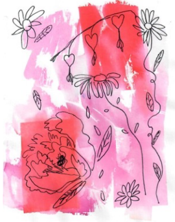
2. Draw flowers on top of your print.