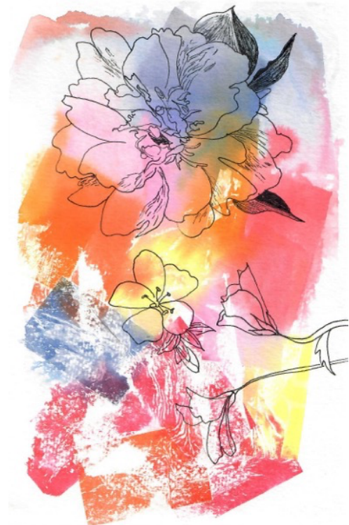
8. Rotate your paper as you draw.