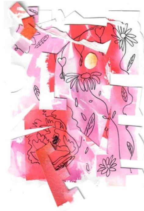
4. Collage the cut edge pieces on top.