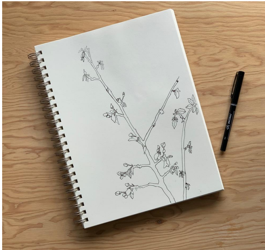
Try drawing contour line drawings indoors as well.