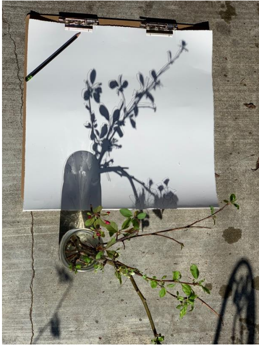
Put a drawing paper under the shadow.