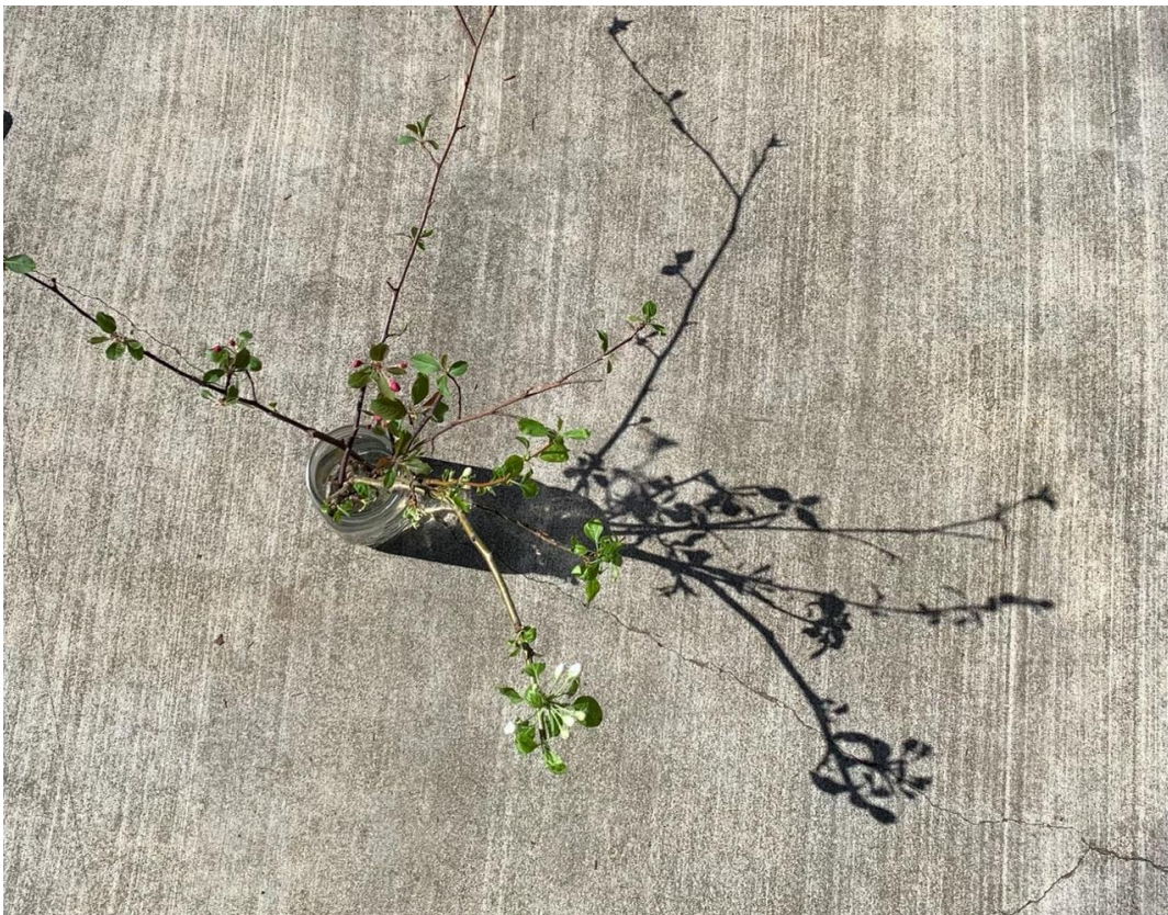
Place your branch blooms outside in the sun or set up a light indoors if it's not sunny.