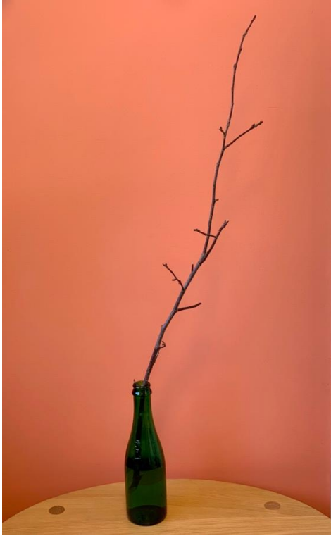
Cut a branch, place indoors in water.