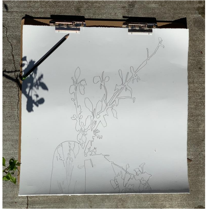
Use a pencil to trace the branch bloom shadow.